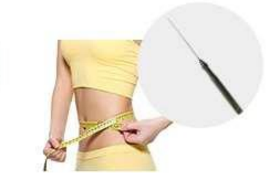
Laser Lipolysis Contouring