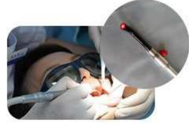
Dental Soft Tissue Surgery